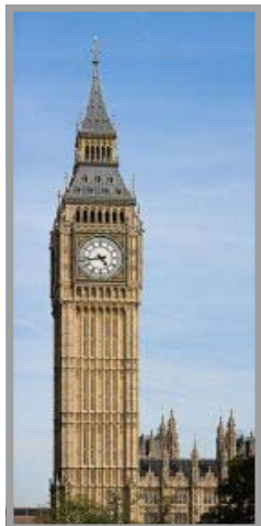
London Clock Tower